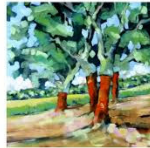
'After the Harvest', 'Depois da tralha' Acrylic on canvas 50x50cm Cork oak harvest at Gavião Montepio Portugal 2013